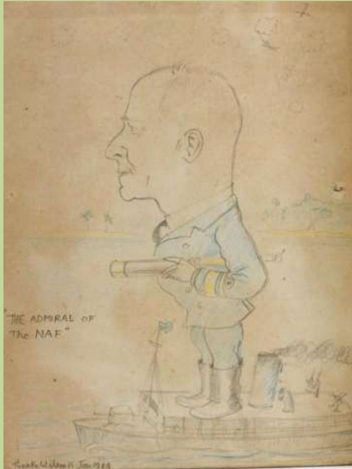
“THE ADMIRAL OF THE NAF”

frequent reference to Binks' Navy – although not always complimentary. The professional training of the Marines, and their high standards of performance, gave little leeway for tolerating incompetence, particularly when they were engaged in operations against the enemy. At times this led to some friction between the Marines and their keen and courageous but, it must be said, somewhat amateurish comrades in the Inland Water Transport service.