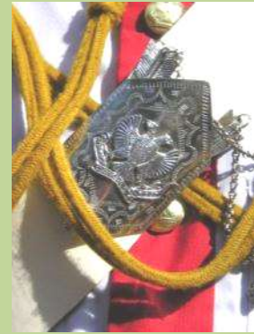
pouch belt plate