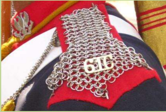
Collar badge, shoulder chains and title