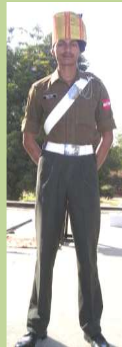
Barrack Dress (Commandant's Orderly)