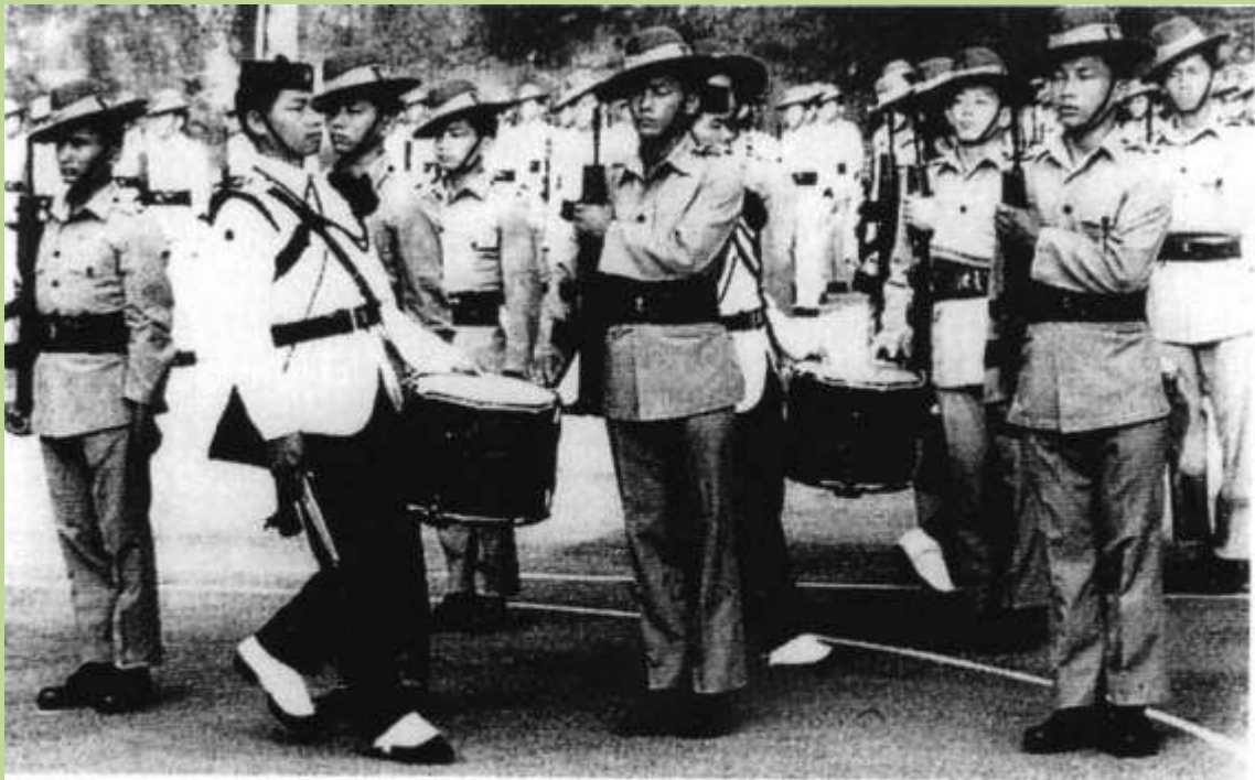
Newly joined soldiers of 7 th Gurkha Rifles are attested by touching the drums bearing the Regiment's battle honours as they are marched through their ranks Hong Kong 1989