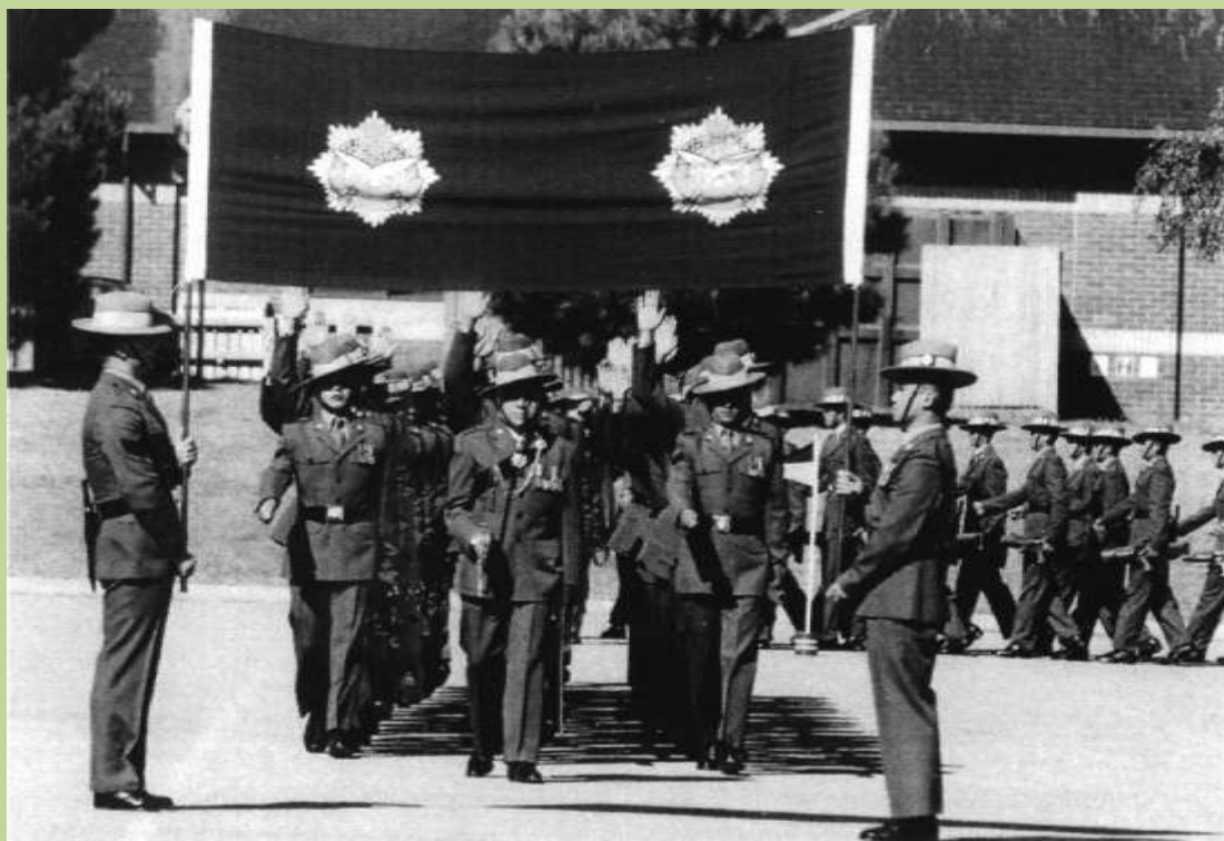
The Queen's Own Gurkha Logistic Regiment Kasam Khane Parade Aldershot 2004